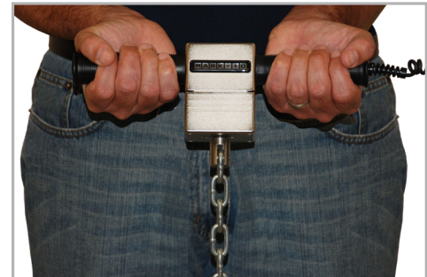
▲ A Series R05 sensor is shown in a typical pull testing application. Chain is not included.