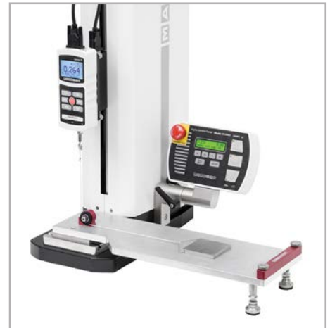
Shown with an ESM303 test stand and G1086 COF fixture

The M5-2-COF includes MESUR™ Lite data acquisition software. MESUR™ Lite tabulates continuous or single point data. Data saved in the gauge's memory can also be downloaded in bulk. One-click export to Excel easily allows for further data manipulation.